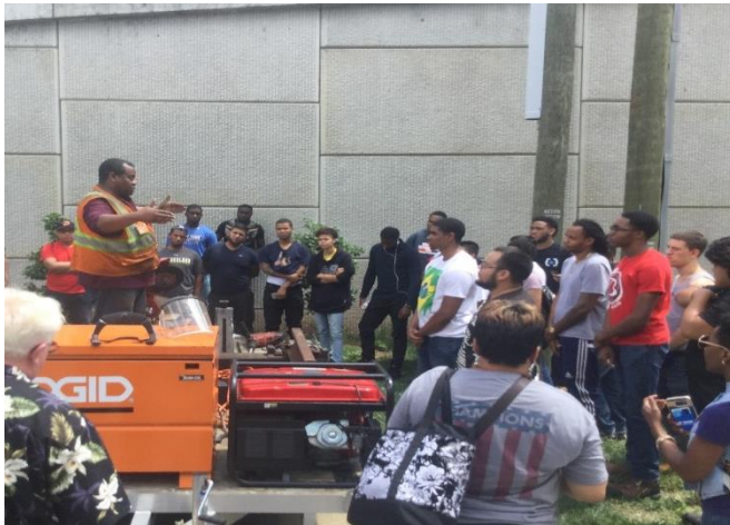
GWP BDCA New Hires in Training

Graduates arrived in the DC area for safety and operational training in early summer last year. GWP has and will continue to work with TDC staff to provide mentoring and career guidance for the young adults until they establish individual self-reliance, and are assured to be on the right path to career advancement.